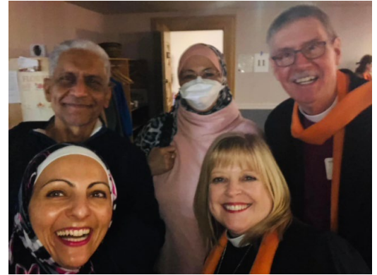
Congregation members from the Southwestern Washington Synod and the Northwest Washington Synod are shown in the large group photo above left. Photo right above, we talked with friends of ours from the Washington Islamic community who were also at the FAN event.